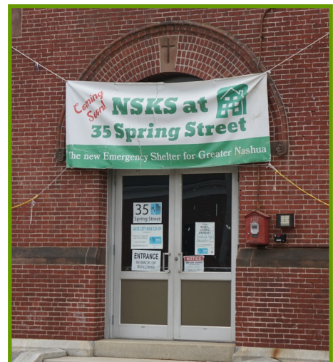
Nashua Soup Kitchen and Shelter