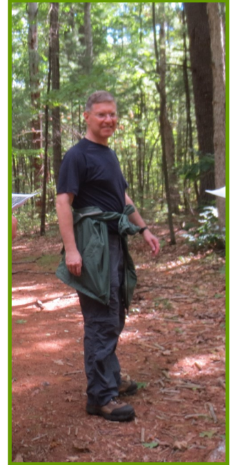
Salem Town Forest