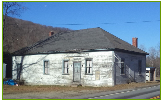
Willing Workers Hall, Warren