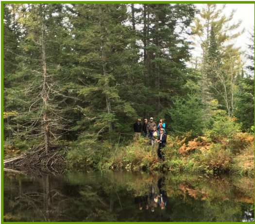
Ammonoosuc River Forest, Bethlehem